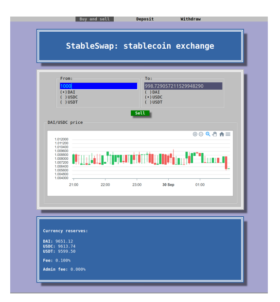
Figure 3: Stableswap UI